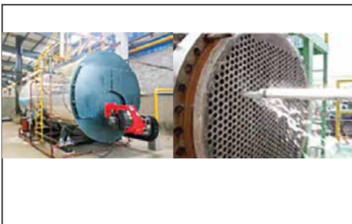
Boiler Water Treatment Chemicals