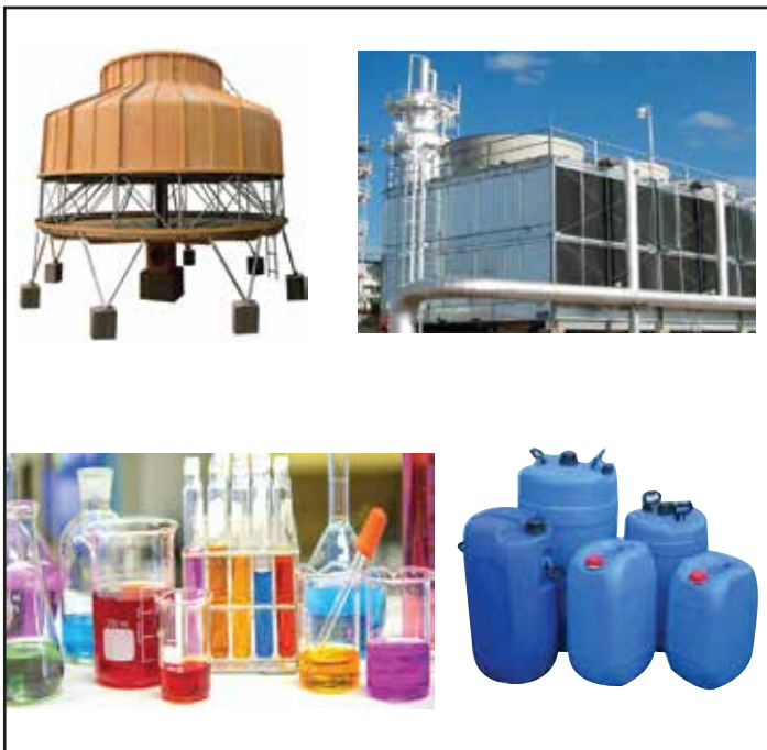
Cooling Tower Water Treatment Chemicals