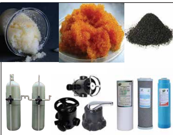
Water Treatment Plants Spears